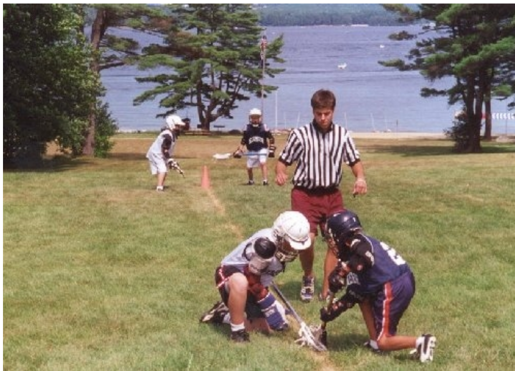
Lacrosse is one of the highlights at Camp Tecumseh. Here we see two campers preparing to face off in The Blue-Gray Classic. A brand new full sized lacrosse field opened in 1999 for the older campers to use.