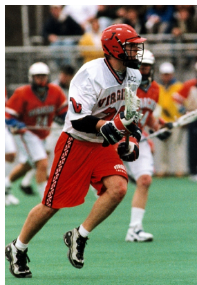
The Banner appreciates UVA's Sports Information Department for providing this photograph.