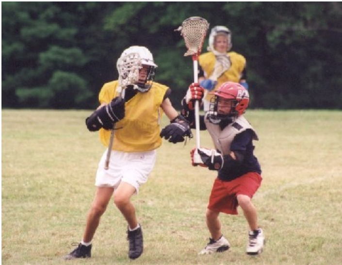
The Stanley Lacrosse Field (located in front of the Farm House) was well used in its second year.