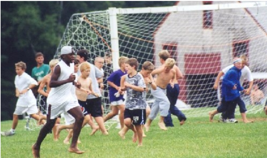
CLINIC 2001 STARTS ON JULY 30 - WILL YOU BE THERE?